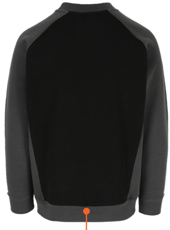
Rib knitted bottom